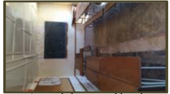
A typical classroom although I also taught under a tree and a tire.

To make a tax free donation go to Grace Ministries International http://www.gracem.org . On the bottom left click on "Make an online donation to GMI." Then under designation, pick 'Nakoli Community School.' "Every bit counts. None of us can do a lot, but we can all do a little."