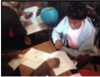
Working with African teachers

There is a great need for classrooms and education in Zambia. Many hundreds of children are on a waiting list to go to school. Education is highly valued but only those families with money can send their children.