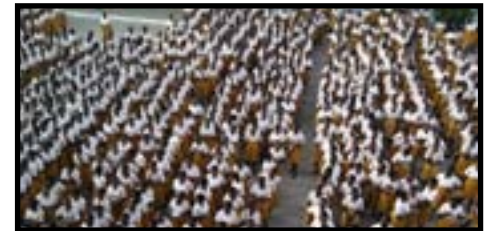
1600 girls at morning assembly Archbishop Porter Takoradi, Ghana

She was part of a cohort of twelve teachers who travelled to Ghana. Their experience began in the capital with an introduction to Ghanaian education, meeting with the Education Ministry, visits to schools both public and private and some “sightseeing”.