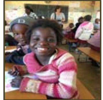
The bright face of a child in Zambia

“I worked with five 11-year old boys learning to read because they finally made it to the top of the waiting list and for the first time were able to go to school. Never have I seen more eager learners.”