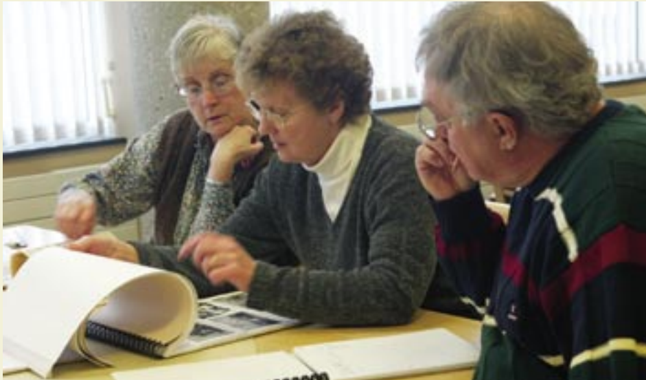
Anyone with an interest in history will find priceless resources in the Clarke Historical Library. Seen here, community members review photos of Broomfield Township Country Schools.