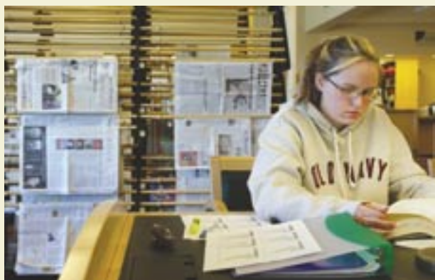
The Mary Dow Reading Room is a treasure trove of the latest magazines and newspapers from around the world.