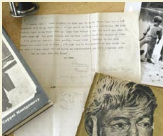
Library holdings include an original five-page letter by Ernest Hemingway describing northern Michigan.