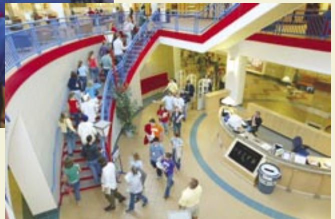
The Okemos Kids Club's summer visit, above, and a new student orientation session were just a couple of the many Park Library tours given this year.