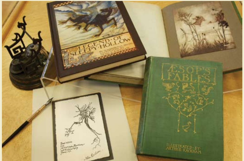
Books illustrated by Arthur Rackham, clockwise from top left: Washington Irving's Legend of Sleepy Hollow , 1928; J. M. Barrie's Peter Pan in Kensington Gardens , 1906; Aesop's Fables , 1912; and one of Arthur Rackham's homemade Christmas cards, 1911.