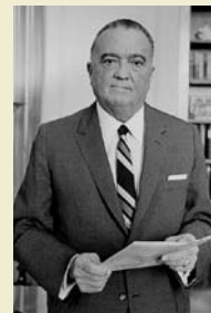
J. Edgar Hoover

Mao Tse-Tung, 1893-1976. Chairman of the Chinese Communist Party. He worked as an assistant to the chief librarian of the University of Peking.