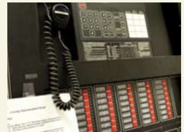
More than 70 student employees in Park Library's Access Services keep the library running smoothly, from opening the doors in the morning to making sure that everyone is out of the library at closing.