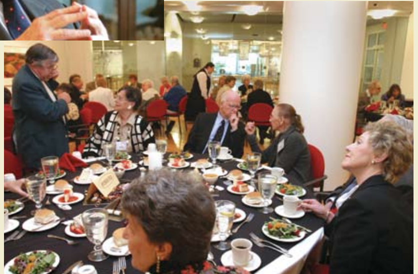
Attendees at the fourth annual Friends of the Libraries luncheon enjoy the company and insights of one of the country's top columnists.