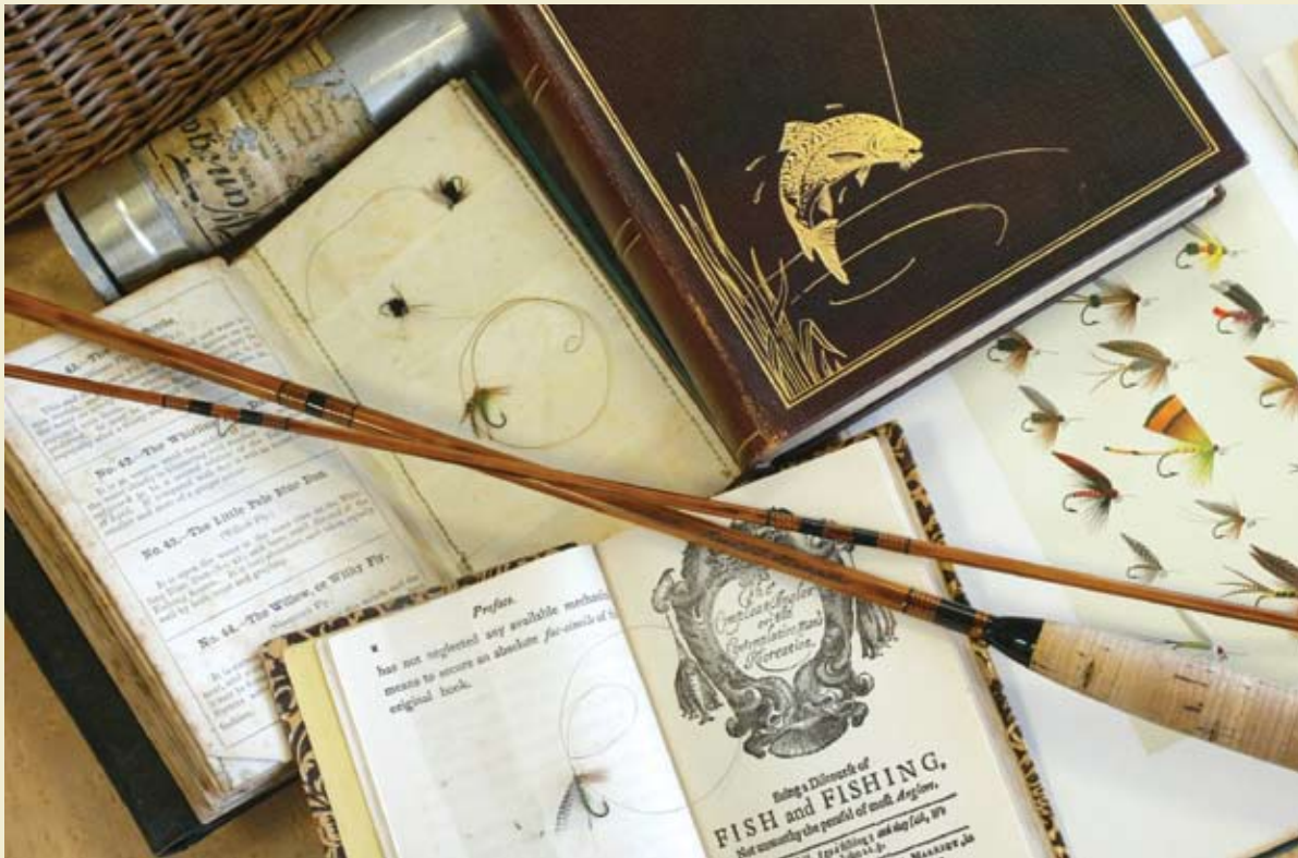
Exhibit documents more than 300 years of fishing history