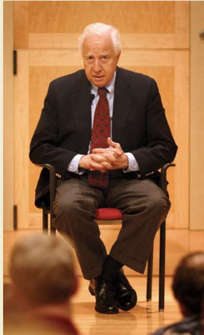
Two-time Pulitzer Prize-winning author David McCullough shares his writing insights with a crowd of eager CMU students the morning of his daylong visit to the university last spring. McCullough concluded his campus visit with a public presentation for members of the CMU and Mount Pleasant communities.

“Time needs to pass before we can see things clearly. The things that were said about Harry Truman in his time are just withering. Wait a while before you put him down or up.” •