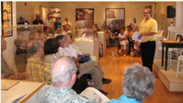
The Up North with the Hemingways event this summer included an exhibit at the Crooked Tree Art Center of Petoskey featuring selections of Hemingway materials from Clarke Historical Library.