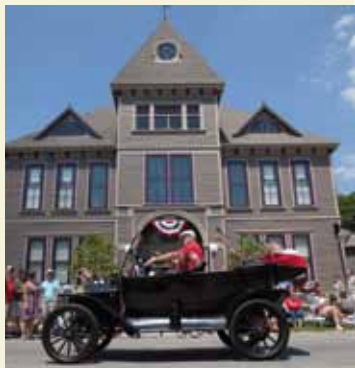
Harbor Springs History Museum