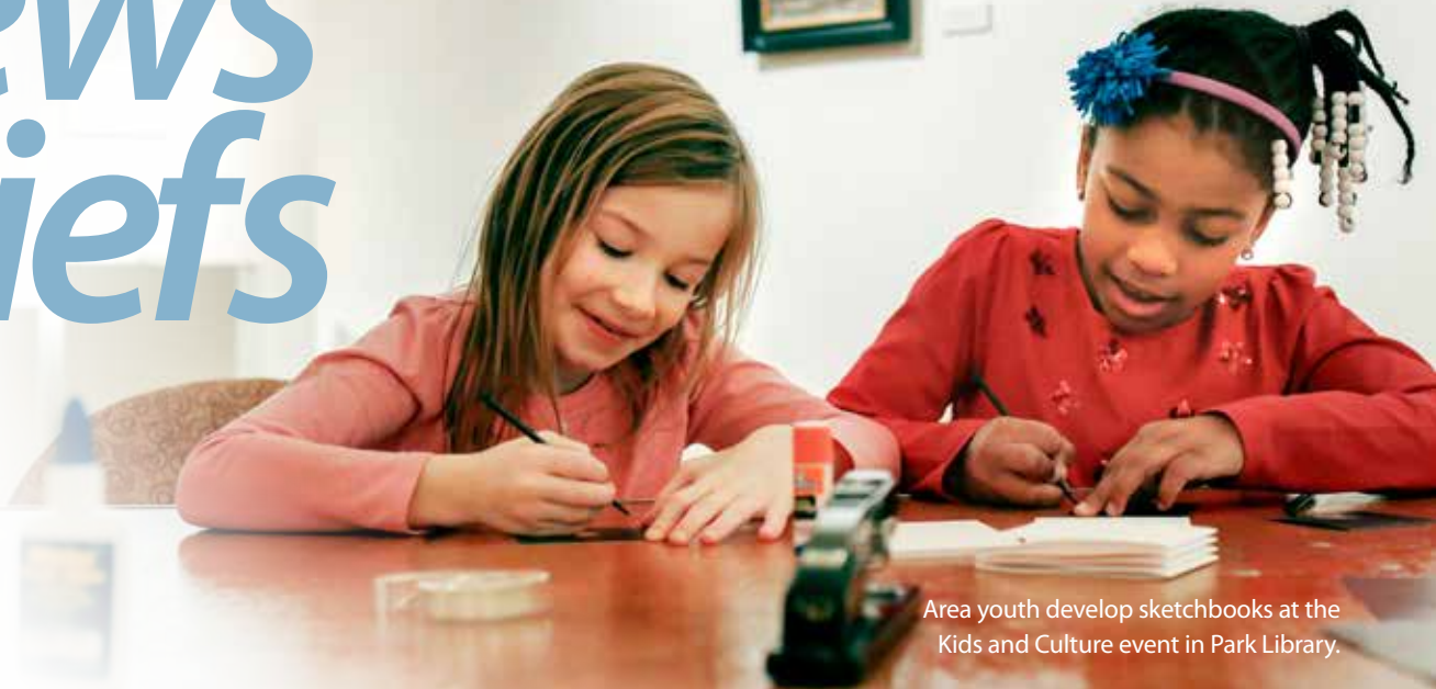
Area youth develop sketchbooks at the Kids and Culture event in Park Library.