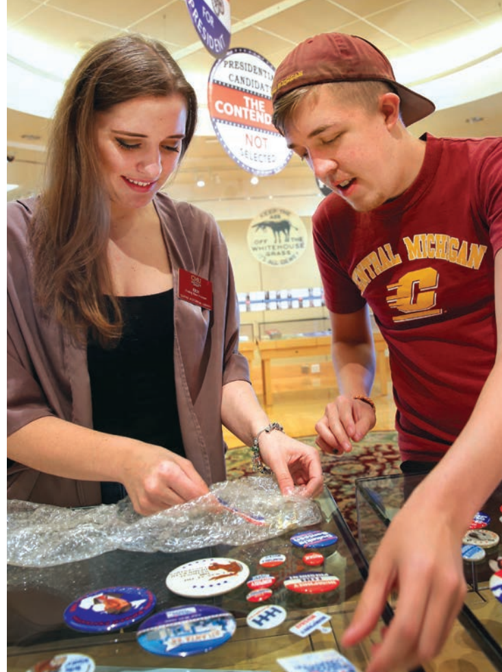
Exhibit features everything but the winning candidate