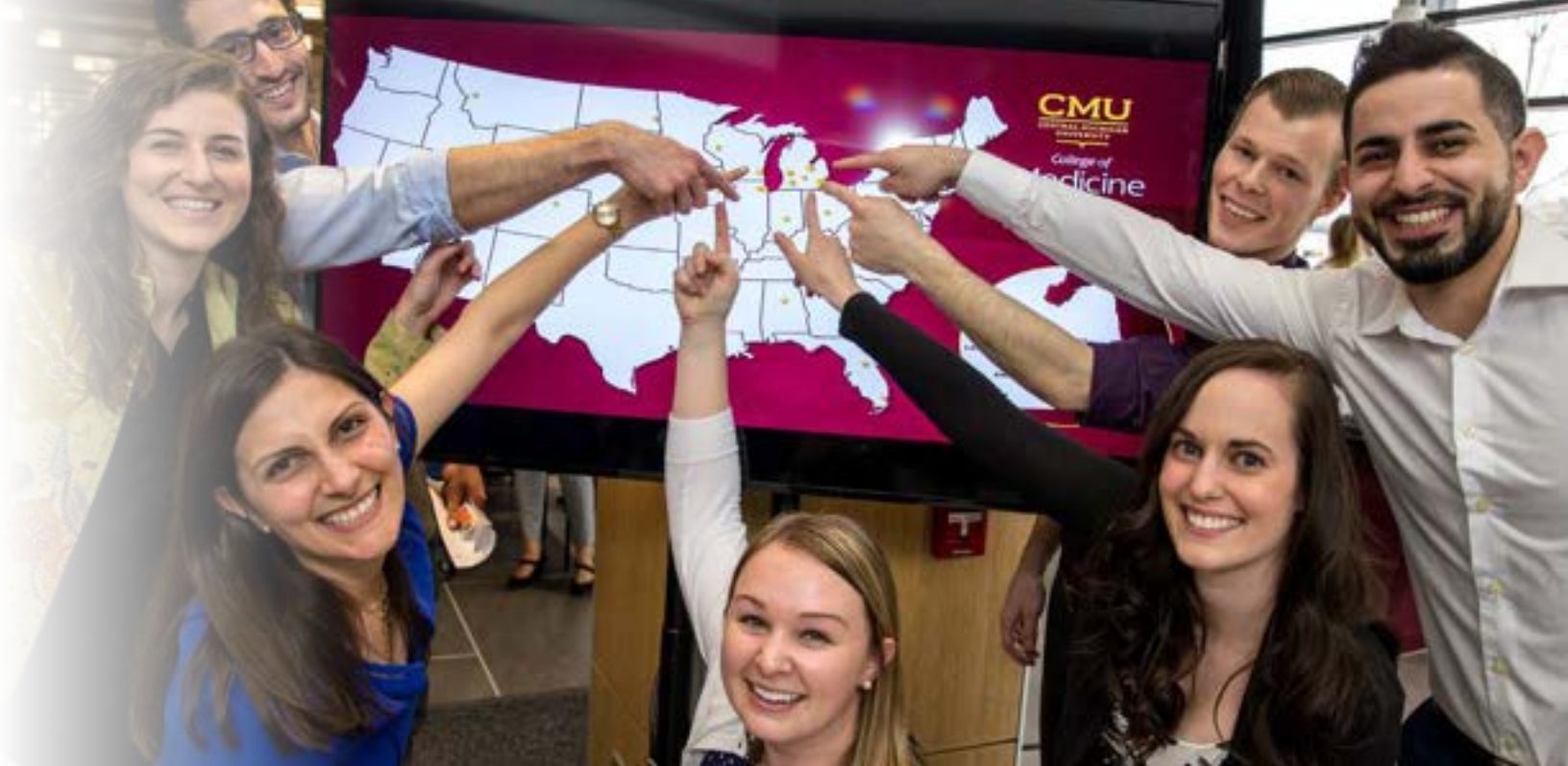
CMU College of Medicine students celebrate their residency placements on Match Day 2017.