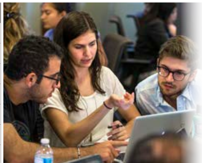
The first day of school for CMU College of Medicine's fourth entering class, in August 2016.