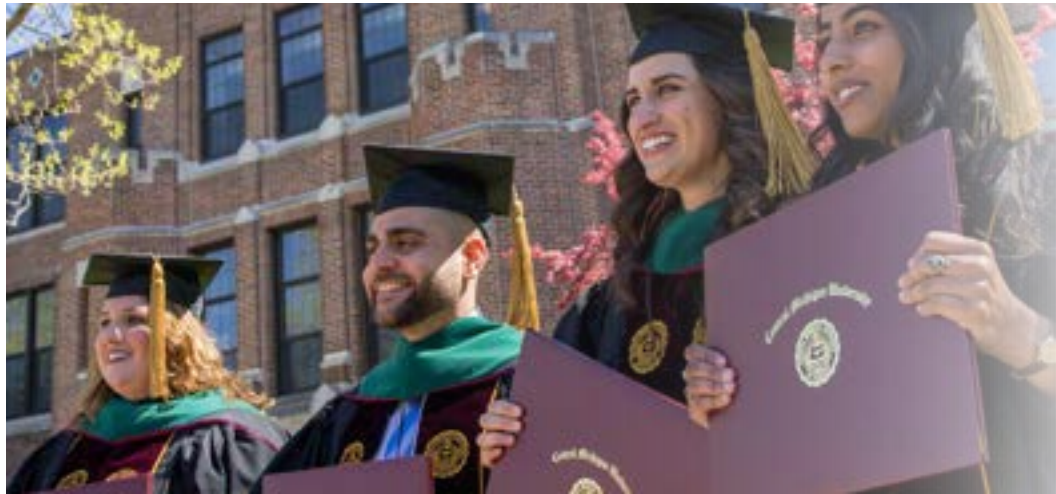
The inaugural class of CMU College of Medicine students graduated on May 7, 2017.

As trailblazers, our faculty members formed partnerships with students and the community, forging a strong foundation. We are thankful to those physicians and hospital partners who supported clinical rotations for our students throughout the state of Michigan. A network of nearly 500 community-based, volunteer physician educators served as preceptors