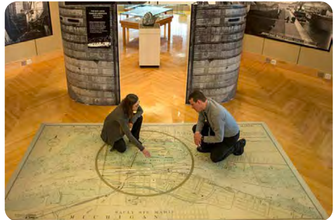
Clark Historical Library