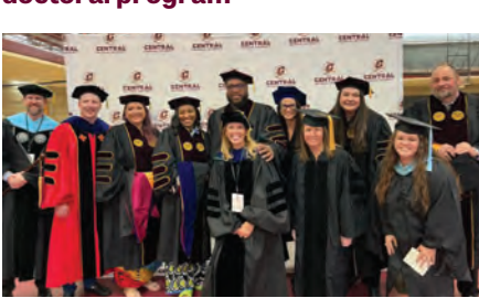
2023 Spring Doctoral Graduates

See the 2023 completed Doctoral Dissertations