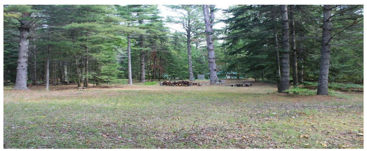
CMUBS Campground Common Area