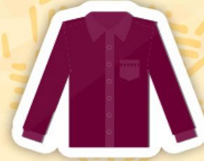
Blouse or dress shirt