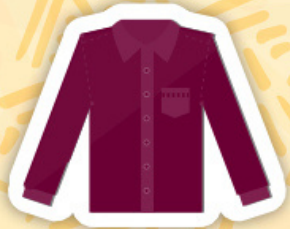
Blouse or dress shirt