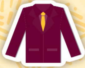
Suit and tie (matching top and bottom)